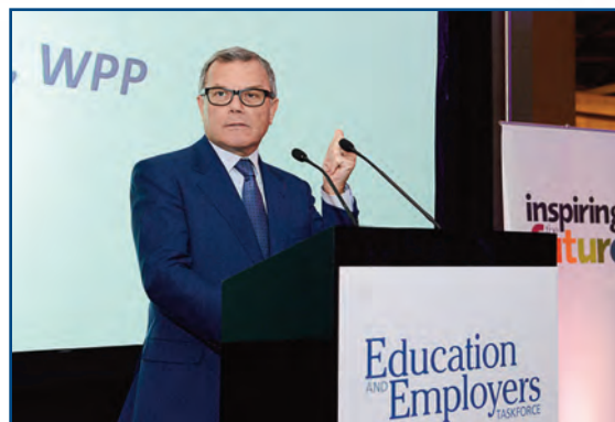
Sir Martin Sorrell, CEO of WPP speaking at the launch of Nothing in Common.