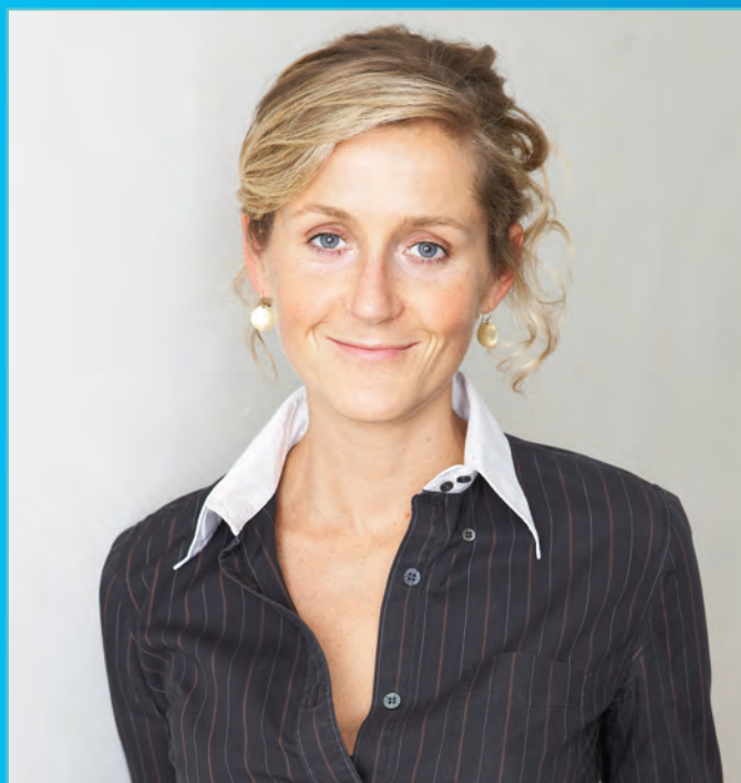
Martha Lane Fox