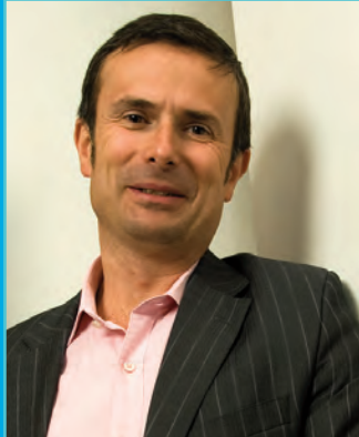
Robert Peston, BBC Business Editor