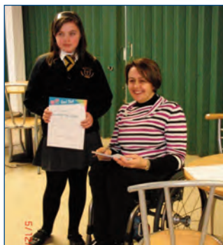
Baroness Tanni Grey-Thompson