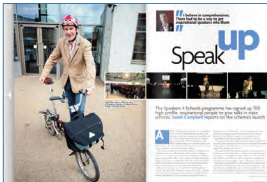
Leadership Focus magazine