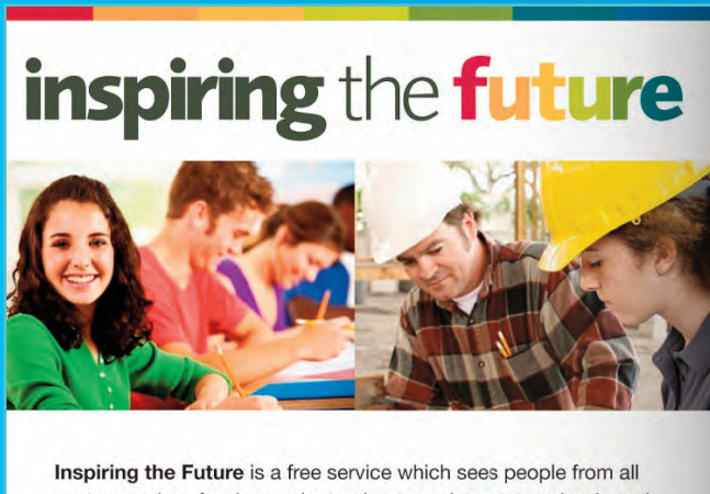
Inspiring the Future is a free service which sees people from all