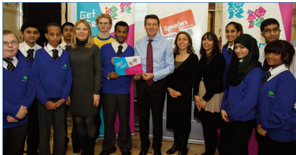
Sebastian Coe and children at Oak Lodge School

A special Speakers for Schools London 2012 Olympics week in December saw Olympic and Paralympic figures giving free talks in state schools and colleges.