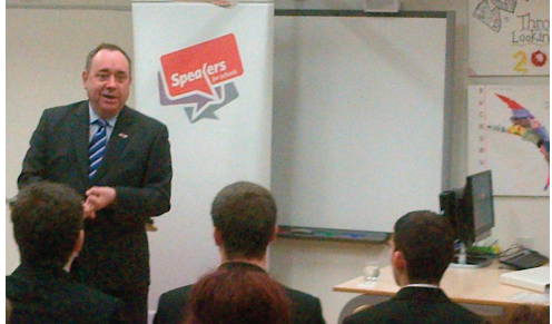
First Minister, Alex Salmond at Bucksburn Academy in Aberdeen.

Read the full press release to see who else took part in the launch. http://bit.ly/SKiHHV