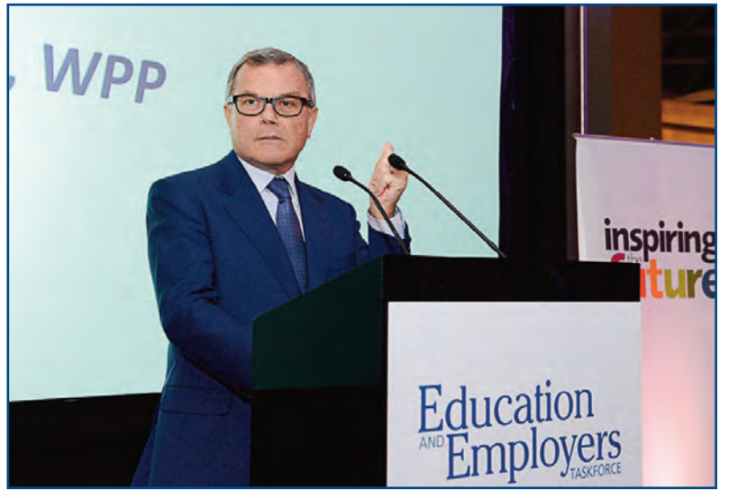
Sir Martin Sorrell, CEO of WPP speaking at the launch of Nothing in Common.

http://www.flickr.com/photos/edu_employers/sets/72157633082972707/